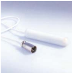
Probe applicator with targeted effect

Unlike conventional magnetic field mats used in magnetic resonance stimulation whose designs produce little beneficial effect, the Cell Rejuvenation System's equifield® applicators provide an even magnetic field for balanced treatment. The equifield® applicators have only one coil that is wound in a spiral configuration. The distance between neighboring wires in different sections of the medium differs, thereby ensuring an even (homogenous) magnet field across the mat applicator's entire surface.