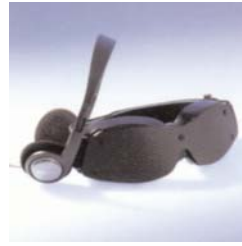
Light therapy glasses

The Cell Rejuvenation System comes with a choice of a wellness or fitness chip card intended for home use and simple application by independent doctors.